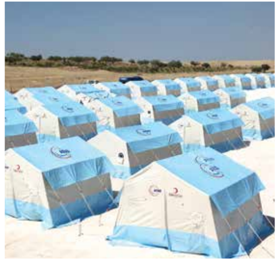
14 m 2 - 16 m 2 - 28 m 2