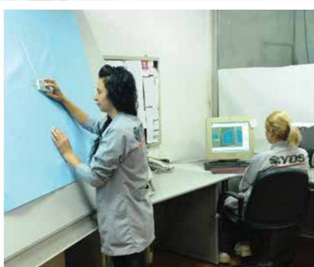
Tent Drawing Unit