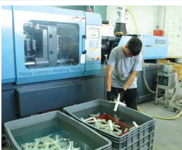
Plastic Injection Molding Team