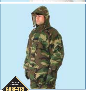
COLD CLIMATE PARKA

Products tailored to provide protection against rigorous cold climate conditions. This can be achieved by using various special fabrics not only to keep the wearer dry and warm but also allows complete freedom of movement.