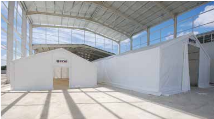
105 m 2 - 210 m 2