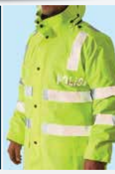
RAINCOAT (high visible)

All around the world the police force have to be in constant combat and operational conditions and require the maximum comfort and this can be achieved using technical performance fabrics.